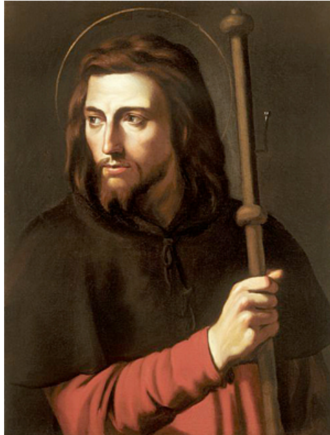
James the Great (anon)

Today, in our service, we hear two stories about St James, one of Jesus's first disciples: