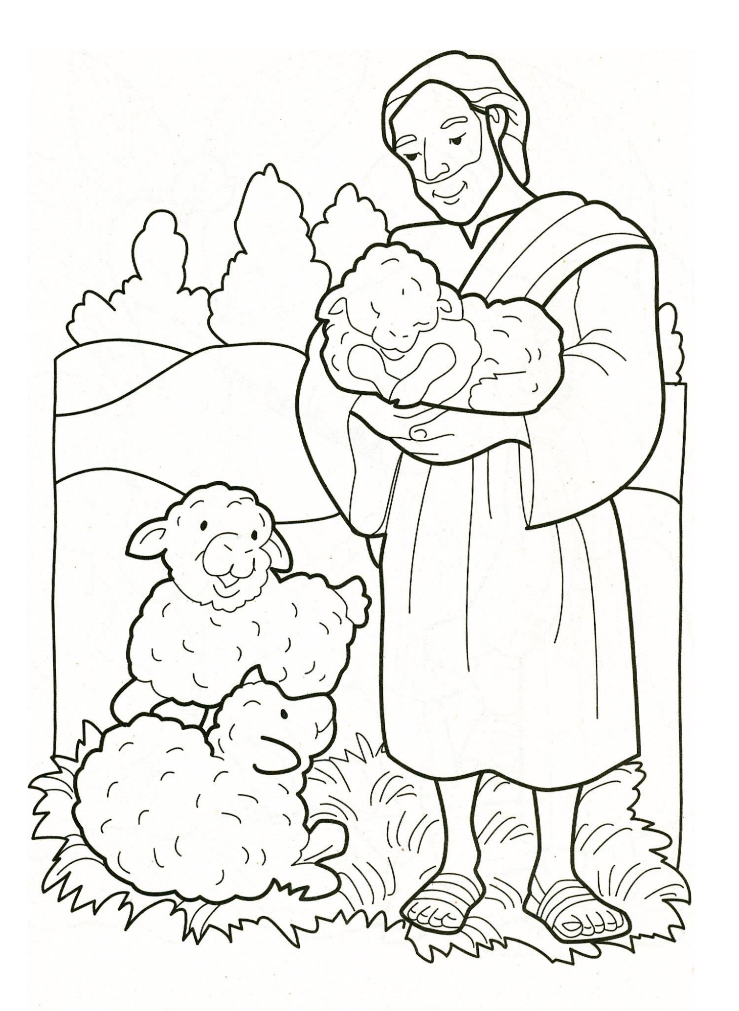
"I am the good shepherd." John 10:11