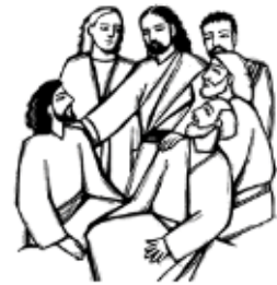
Calling the Twelve to him, he sent them out two by two. Mark 6:7 (NIV)

Each number represents a letter of the alphabet. Substitute the correct letter for the numbers to reveal the coded words.