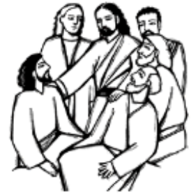
Calling the Twelve to him, he sent them out two by two. Mark 6:7 (NIV)