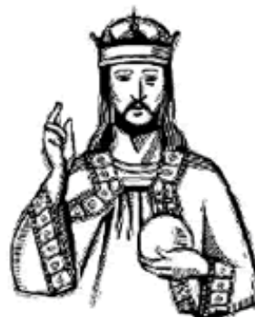
CHRIST THE KING

Each number represents a letter of the alphabet. Substitute the correct letter for the numbers to reveal the coded words.